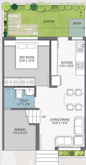
GROUND FLOOR PLAN Built up Area: 505 sq.ft.